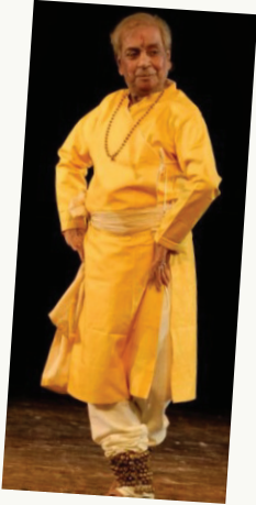
Pandit Birju Maharaj - Madhuri Dixit